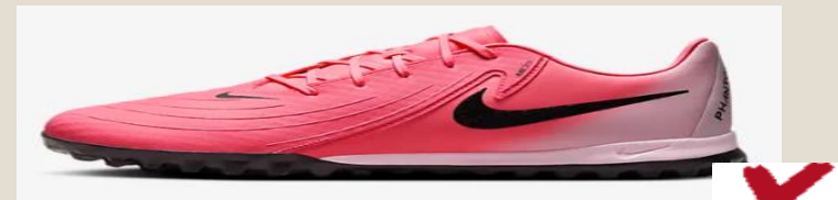
Nike over £50