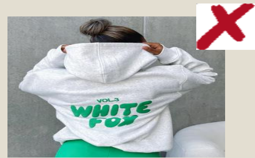
White Fox £50