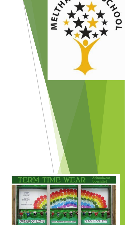
Due to the current climate we have done a thorough risk assessment and feel the following will keep customers and staff safe whilst giving the best customer service we can.

Our 'New Normal' for summer 2020 will be orders only via our website